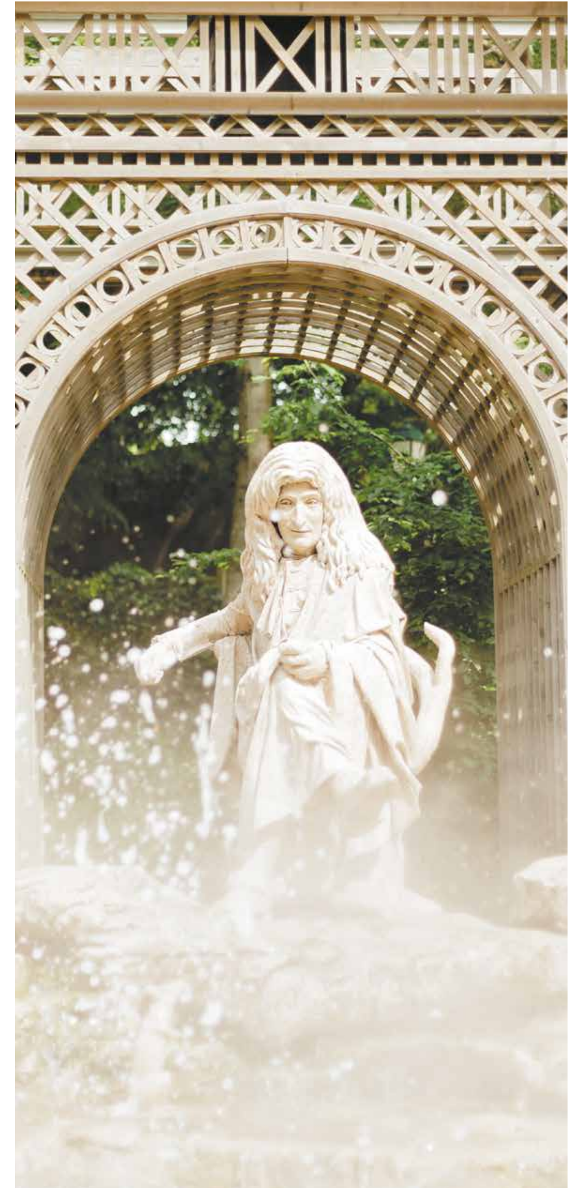
The living statue of La Fontaine (Puy du Fou France)

La Fontaine's Le Monde Imaginaire illustrates the relationship which Puy du Fou wishes to perpetuate with nature and animals: a kind-hearted, close relationship focused on caring and respect. And, just like in the Fables, nature is the first - and perhaps the most exquisite - stage set at Puy du Fou, where animals take pride of place. And, just like for La Fontaine, flowers, trees and animals are the focus of our creation.