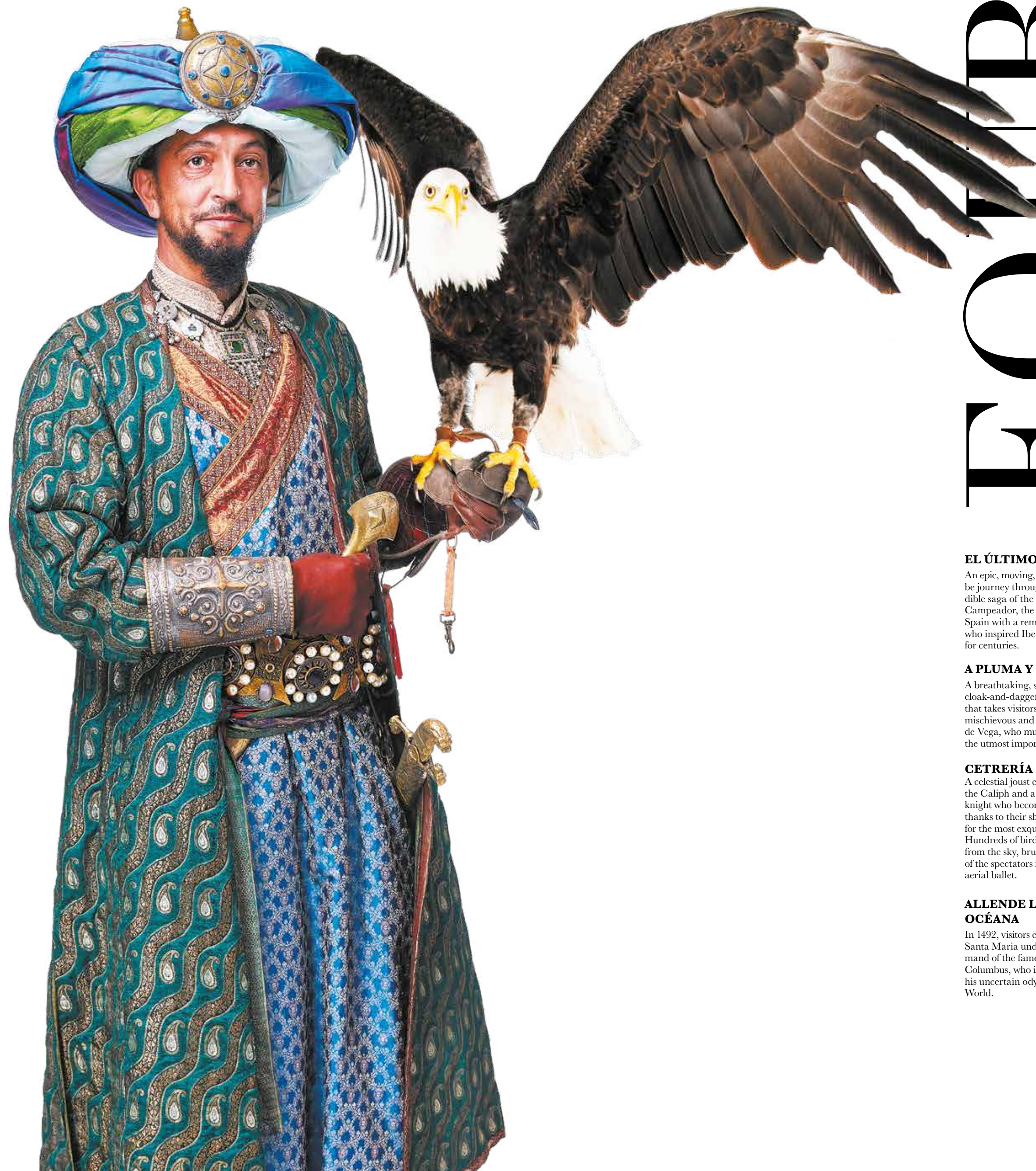
Abdérame III and his goshawk

Lead role in the show "Cetrería de Reyes" (Puy du Fou España)